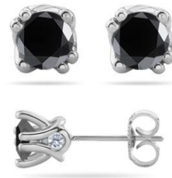
Price:$ 926.40 2.07 Cts Black & White Diamond Earrings in 14K White Gold(159328) View