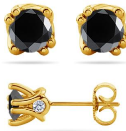
Price:$ 886.50 2.07 Cts Black & White Diamond Earrings in 14K Yellow Gold(159319) View