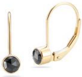
Price:$ 295.00 0.56 Cts Black Diamond Earrings in 14K Yellow Gold with Lever Backs(120831) View