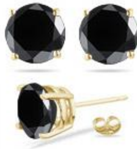
Price:$ 421.44 Black Diamond Studs 2 Ct AAA QUALITY in 14K Yellow Gold(3249)