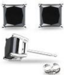
Price:$ 185.00 Black Diamond Princess Studs 1 Ct in 14K White Gold(3039) View