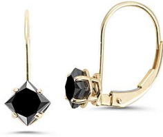
Price:$ 399.00 1.31 Cts Black Diamond Stud Earrings with 14K Yellow Gold.(120844) View