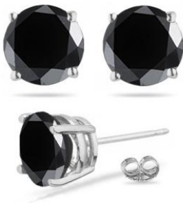
Price:$ 213.84 Black Diamond Studs 1 Ct AAA QUALITY in 14K White Gold(3204)