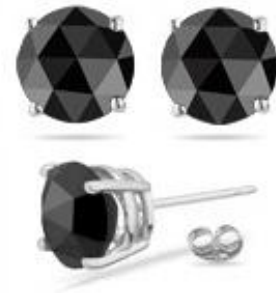
Price:$ 324.00 1.50 Cts Round AAA -Rose Cut Black Diamond Stud Earrings in 14K White